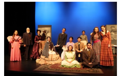
SYTCO Cast of Little Women 2013

If there is something that interests you, that you would like to see us do a class on, please email us at info@peninsulaartsfoundation.org