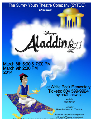
(SYTCO) Performs Aladdin March 8 and 9th